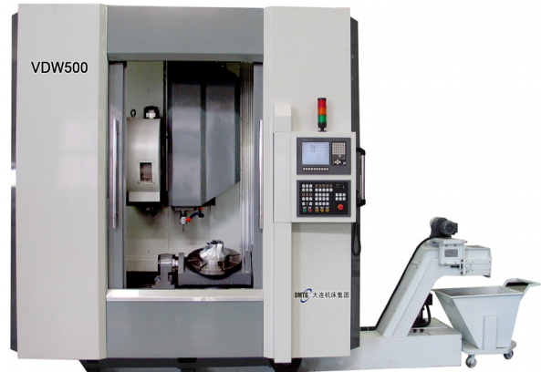
VDW500 Vertical 5 Axis Machine Center

“The Chinese machine tool market is growing rapidly and we plan to diversify our product line to include state-of-the-art 5-axes machines primarily targeted to the aerospace and automotive industries,” said Baoqing Zhou, Chief Engineer at Dalian. “ICAM has been the leading supplier of advanced NC manufacturing software products worldwide for over 35 years and we are confident that our customers will now benefit from an integrated NC post-processing and machine tool simulation solutions allowing them to capitalize on Dalian machine tool investments.”