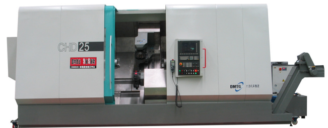
DMTG CHD 25 9-Axis Mill/Turn